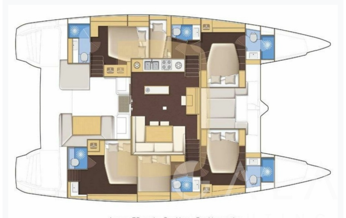
Lagoon 52 version 6 cabines - 6 cabins version

APA (Advance Provisioning Allowance): The Charterer will be charged extra, at cost to the yacht, for all other expenses, which is covered by the APA, 30 % of the charter fee. These expenses include fuel for the yacht, fuel for the ski-boats or other tenders, food for the charterers, wines, beers, spirits and soft drinks for the Charterers, other consumable stores, berthing dues and other harbour charges away from the yacht's own berth,hire costs of special equipment placed on board at the request of the Charterer.